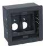
Square Flush Mount Box HBLSHA2