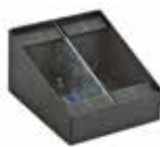
Surface Mount Box HBLCON2