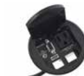
Pre-Wired Dual-Service Box TTBD51BK