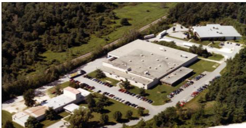
Harbour Industries' Facility in Shelburne, Vermont