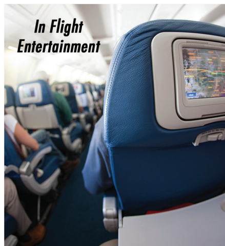
In Flight Entertainment