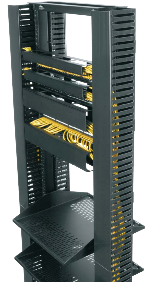
PCD shown on RLA series 2 post rack