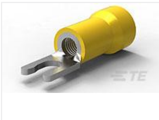
TE Part #52961-1 TERMINAL,PG SPR SPD 12-10 6