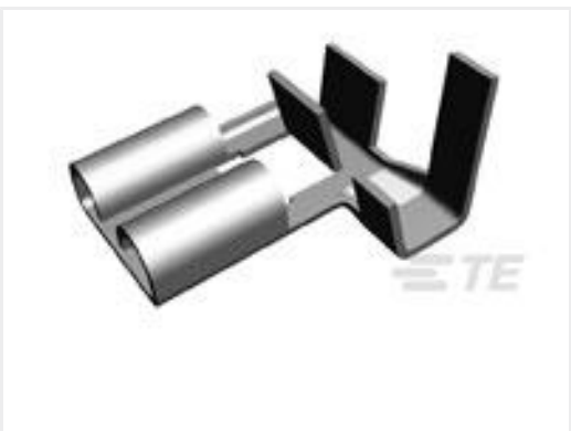
TE Part #63963-1 250 FASTON FLAG REC 18-14 AWG NPST