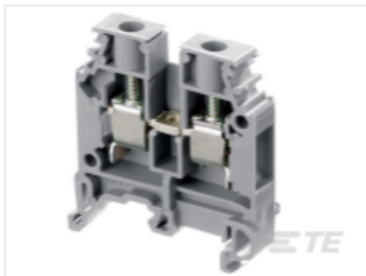
TE Part #1SNA105004R2200 M6/8