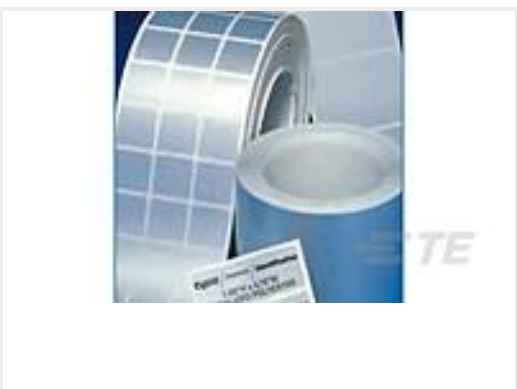
TE Part #D54063-000 WP-101101-1.3-9