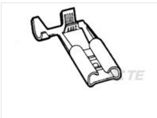
TE Part #1-280050-3 250 FASTON,FLAG,REC.,16-20 AWG, NPST