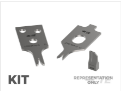
TE Part #7-2837833-7 OCEAN_2.0_SPARE_PART_KIT-094F130F