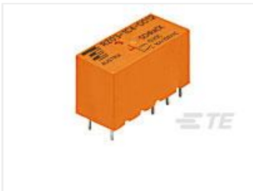
TE Part #4-1415899-7 RZ03-1A3-D005