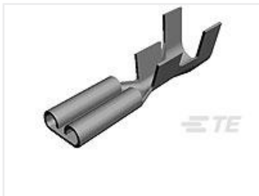
TE Part #42579-1 250 FASTON REC 16-12 AWG NPST