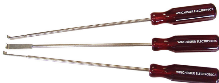
Extraction Tool Part Number 107-1506