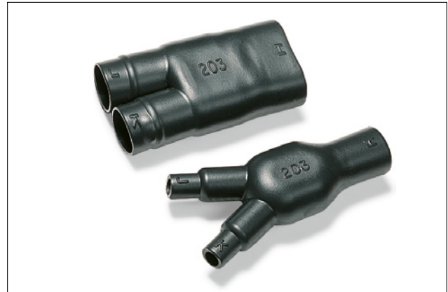
Two-way outlet shape 223-2 supplied / fully recovered.