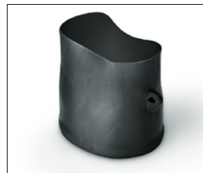
150 Series supplied.