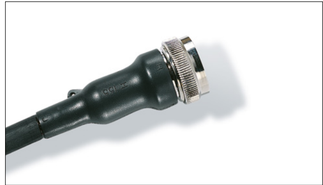
150 Series boot recovered onto a connector.