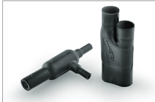
1204-1 supplied / fully recovered.