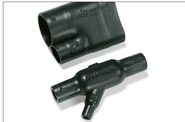
1303-1-G supplied / fully recovered.