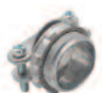
650-DC2 thru 676-DC2

For connecting nonmetallic cable to box or enclosure.