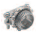
660-DC2 thru 666-DC2