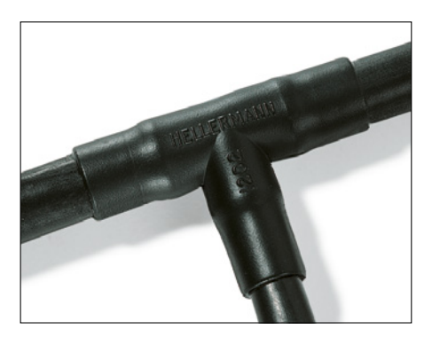
1202-1-G recovered onto a cable harness.

• Strain relief, sealing and mechanical protection on cable harnesses