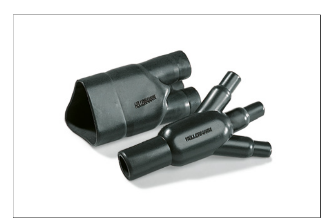
304-1-G supplied / fully recovered.