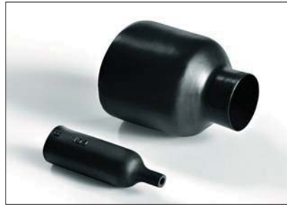
109-1-G supplied / fully recovered.

This style provides connector cable strain relief. Can be installed on the connector rear thread or plain shaft and allows easy re-entry for repair when combined with a hot melt adhesive.