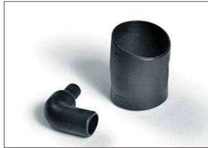
1108-1 supplied / fully recovered.

This style provides connector cable strain relief. Can be installed on the connector rear thread or plain shaft, allows easy re-entry for repair when combined with a hot melt adhesive.