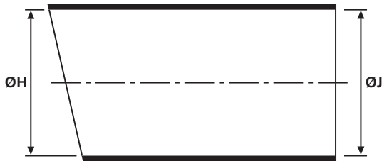
a: Expanded form (supplied)