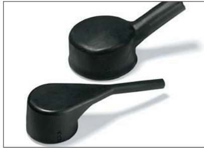
1135-1-G supplied / fully recovered.

This style provides connector cable strain relief. Used in applications for partially loaded connectors with small cable diameters. The tail is designed to allow easy orientation prior to cooling.