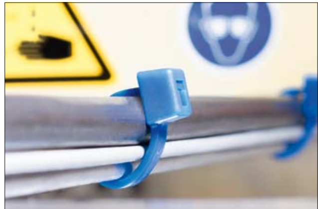
T-Series E/TFE cable ties – for higher chemical resistance up to +170 °C.