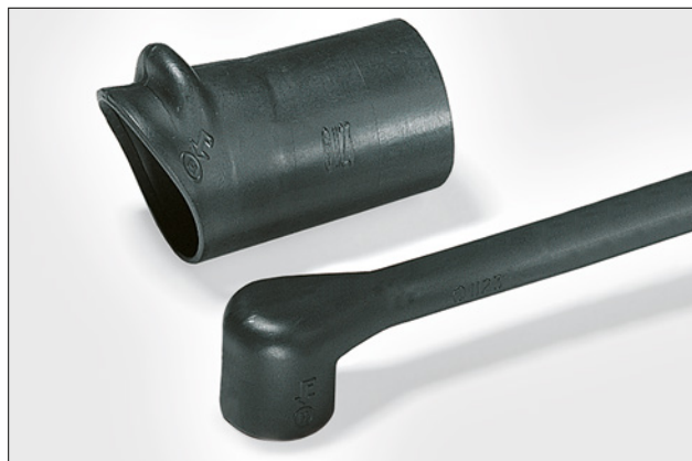
1123-1-G Supplied and recovered.