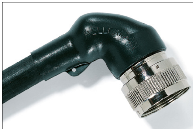
1152-4-G recovered on to a connector.