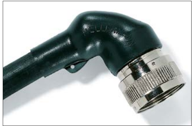
1152-4-G recovered on to a connector.