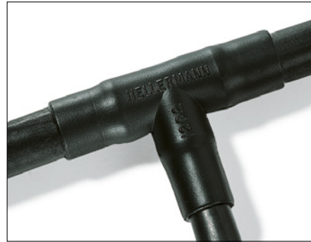
1202-1-G recovered onto a cable harness.