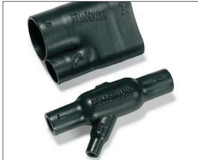
1303-1-G supplied / fully recovered.

This style provides strain relief, sealing and mechanical protection on cable harnesses. For VG shapes with portholes "P" please refer to product standards tables in the appendix.