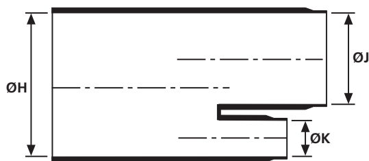
a: Expanded form (supplied)