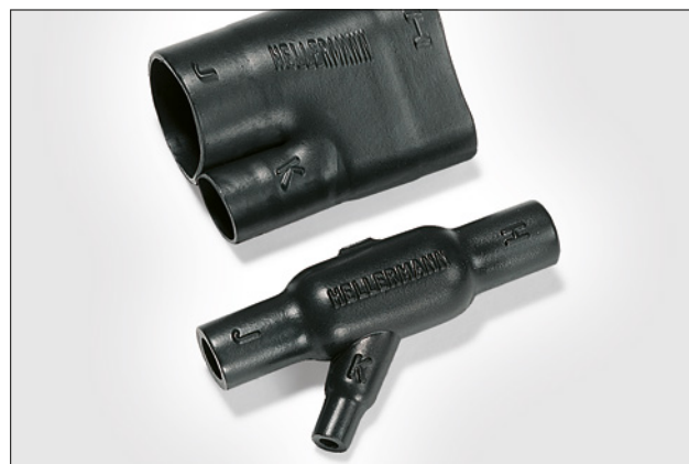
1303-1-G supplied / fully recovered.