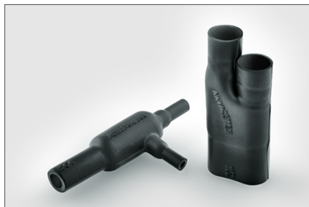
1204-1 supplied / fully recovered.