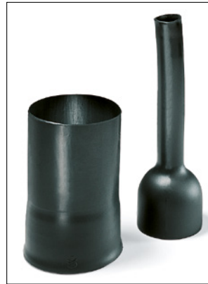
135-1-G as supplied / fully recovered.