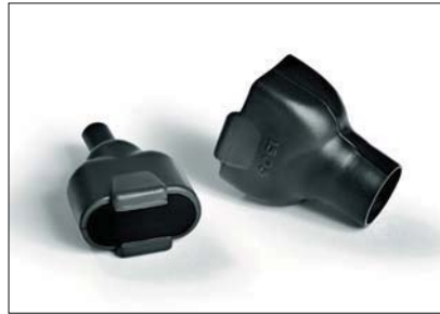
1505-1 supplied / fully recovered.

This style provides strain relief and mechanical protection for Min-D series connectors. It's unique design allows perfect orientation on installation, can be supplied with or without lips.