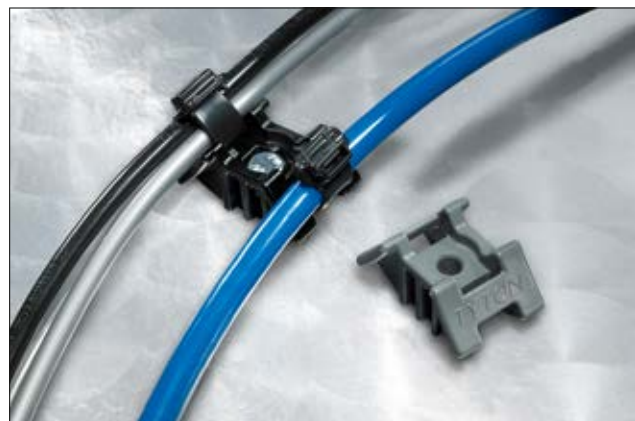
This saddle mount is installed between two bundles to separate them and prevent chafing and wear.