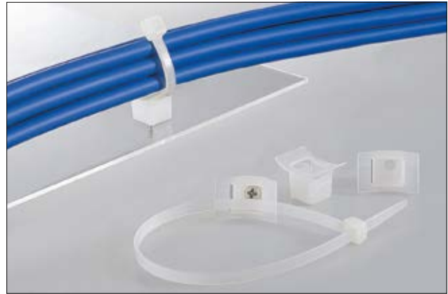
Cable Tie Mounts LKC Series.