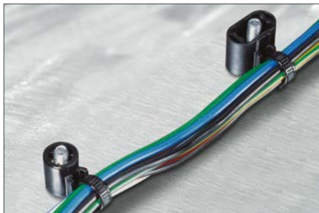
This outside serrated cable tie with weld stud mounting keeps the cables close to the fixing stud.