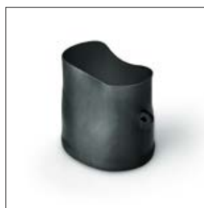
150 Series supplied.