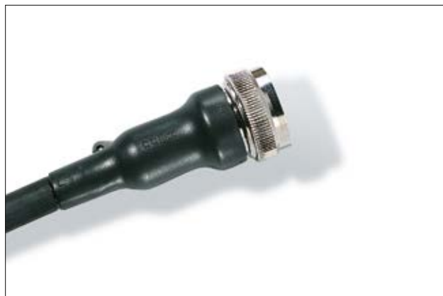
150 Series boot recovered onto a connector.

For Material / Adhesive information please refer to page 244.