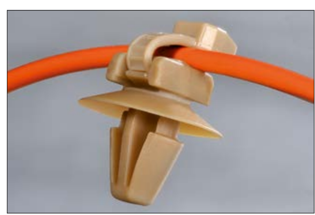
PEEK Fixing Ties can be used for small diameters from 1.0 mm.