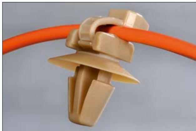
PEEK Fixing Ties can be used for small diameters from 1.0 mm.