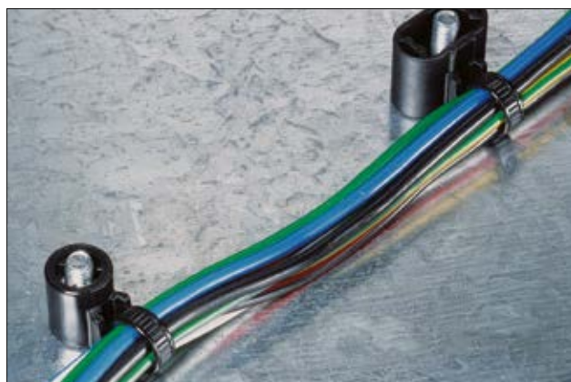
This outside serrated cable tie with weld stud mounting keeps the cables close to the fixing stud.