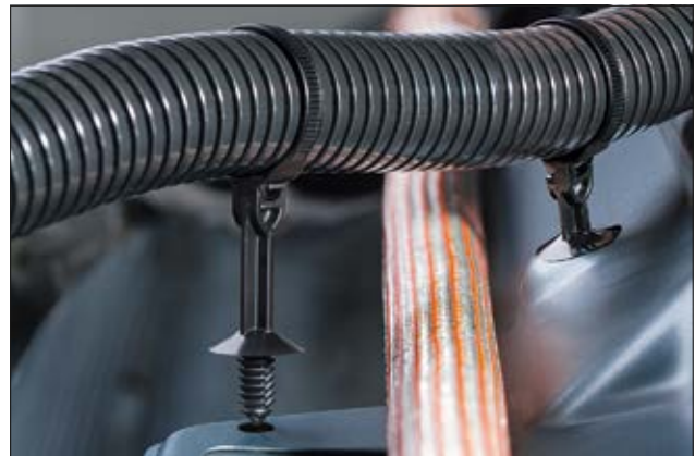
T50ROSFT625SO and T50ROSFT612.5SO.