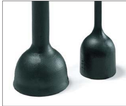
177-1-G supplied / fully recovered.

This style provides cable strain relief in applications using partially loaded connectors, resulting in small cable diameters. When used in conjunction with our W24 adhesive, excellent chemical resistance can also be achieved.