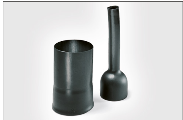
135-1-G as supplied / fully recovered.