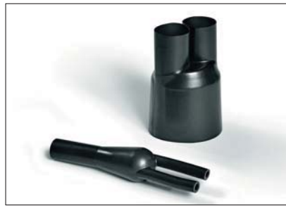
223-2 supplied / fully recovered.

Branching parts are used for easy, time-saving insulation of the branch point of a cable where it is split into single wires. Branching parts with hot melt adhesive also serve to relieve the mechanical tension in cable harnesses.