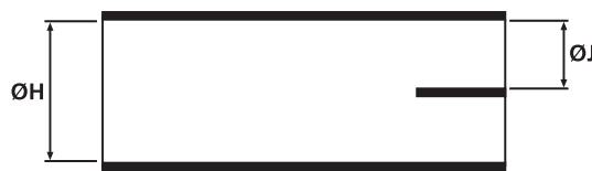
a: Expanded form (supplied)