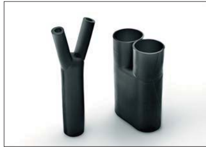
203-1-G supplied / fully recovered.

Branching parts are employed for mechanical tension relief in harnesses, where multi core cables are required to be routed out in different directions. High ratio expansion allows for quick and easy installation times.