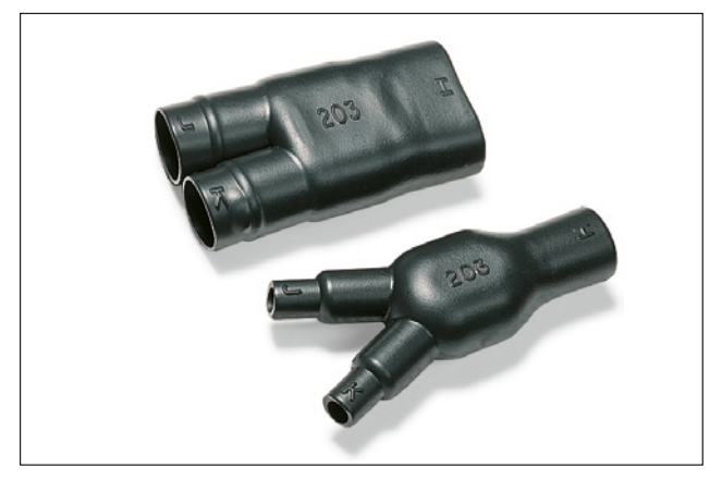
Two-way outlet shape 223-2 supplied / fully recovered.

• Mechanical tension relief in cable harnesses