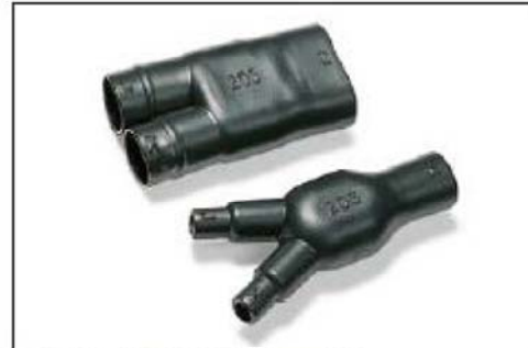
Two-way outlet shape 223-2 supplied / fully recovered.