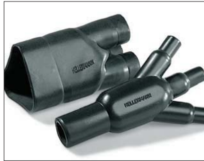
304-1-G supplied / fully recovered.

This style provides cable strain relief and mechanical protection at harness transition points, all outlets are clearly marked to aid orientation on installation.