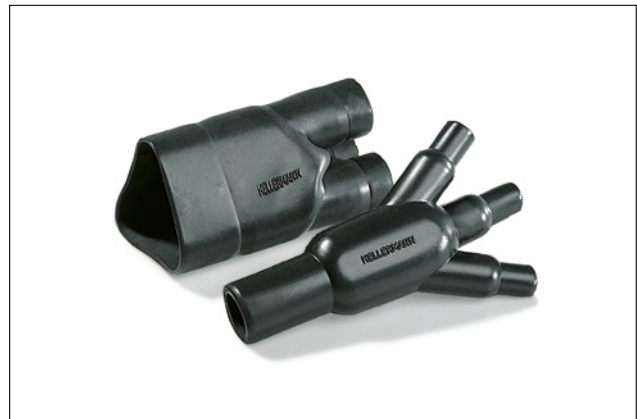
304-1-G supplied / fully recovered.