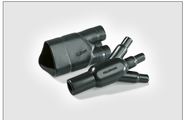
304-1-G supplied / fully recovered.