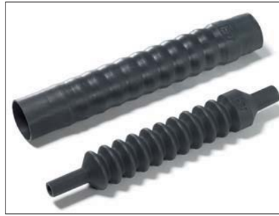
313C722-774 Series supplied / fully recovered.

The convoluted design provides the flexibility to accommodate different cable outlet angles.