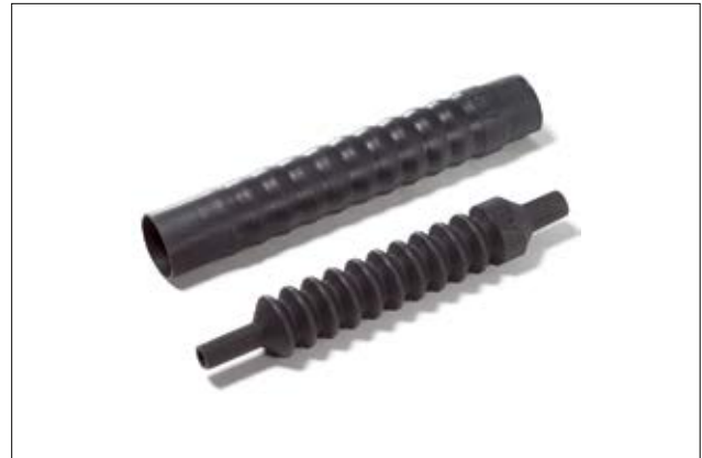
313C722-774 Series supplied / fully recovered.