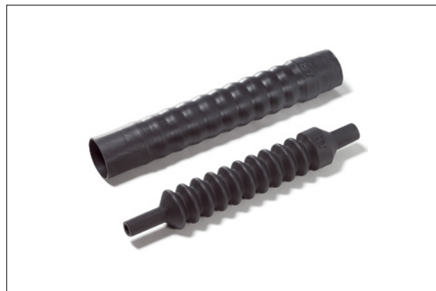
313C722-774 Series supplied / fully recovered.