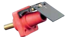
16S21 Mounted on 16R24-14R