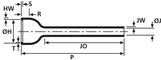
b: Fully recovered form (after heating)