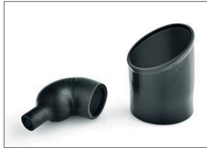
1108-4 supplied / fully recovered

This style provides strain relief for harness systems when used in conjunction with circular grooved adaptor.