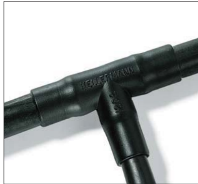
1202-1-G recovered onto a cable harness.

This style provides strain relief, sealing and mechanical protection on cable harnesses. For VG shapes with portholes "P" please refer to product standards tables in the appendix.