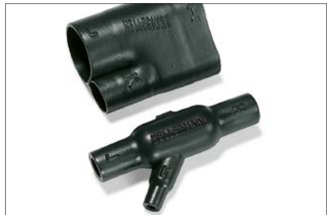
1303-1-G supplied / fully recovered.