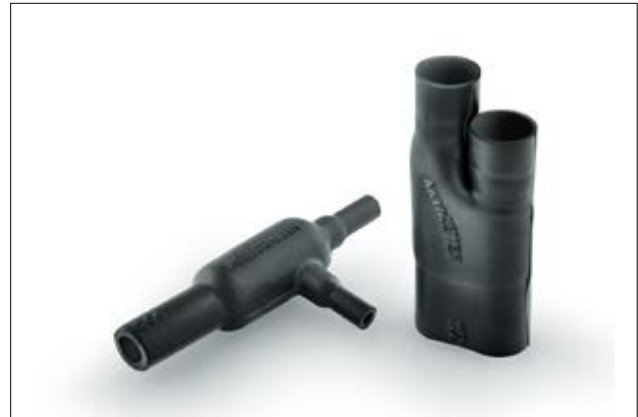
1204-1 supplied / fully recovered.