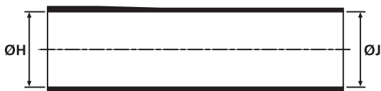
a: Expanded form (supplied)