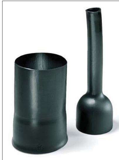
146-1 supplied / fully recovered.

This style is low profile and lightweight, ideally suited to aerospace harness assemblies, the extended tail provides excellent strain relief and flexibility.