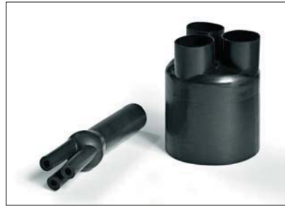
300 Series supplied / fully recovered.

Branching parts are used for easy, time-saving insulation of the branch point of a cable where it is split into single wires. Branching parts with hot melt adhesive also serve to relieve the mechanical tension in cable harnesses.